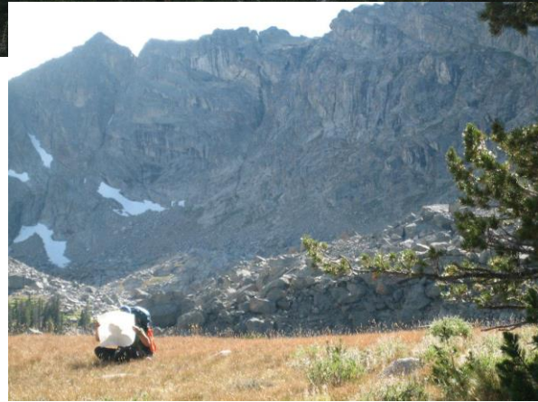
我的朋友 Carl 正在一面用地图一面享受阳光

秋天的时候我决定去怀俄明爬山。二十三天我们背背包爬山，只带了最重要的东西：食物和的衣服。我的背包很重，有六十多磅！我们需要地图探路。幸运的是我们没有走失。虽然背包很难，可是很值得！除了下雨天以外，每天风景都很漂亮！旅行的时候我照很多的相：